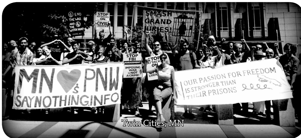
Twin Cities, MN